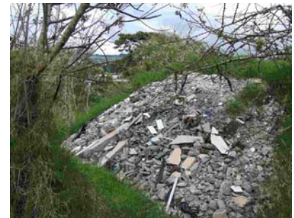
Construction waste dumped on a river side