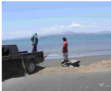
Construction waste dumped in the ocean