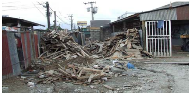
Typical construction sites in developing countries