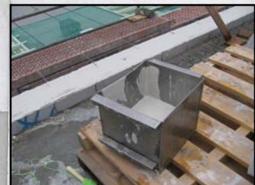
Tool to apply thin layer mortar.