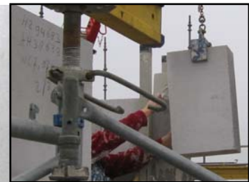
Semi-automated construction method using a small crane.

It is expected that insight in the structural behaviour of post-tensioned shear walls of CASIEL masonry will lead to design rules and ultimately to applications in building practice.