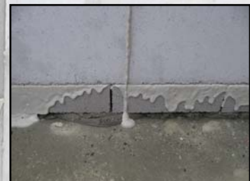
Kicker course for good dimensional set-out and smooth and plumb wall.