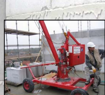
Small crane and CASIELs on 7th story of a building under construction.